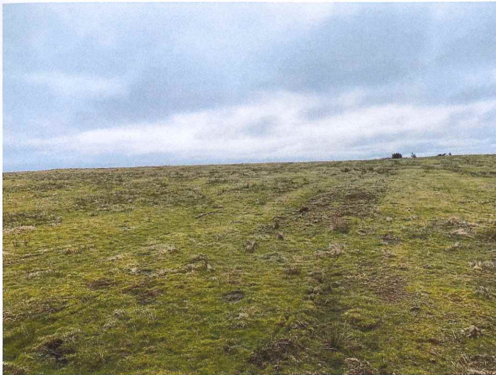
ND/31283/93443 Looking North East from SE corner at roadside.