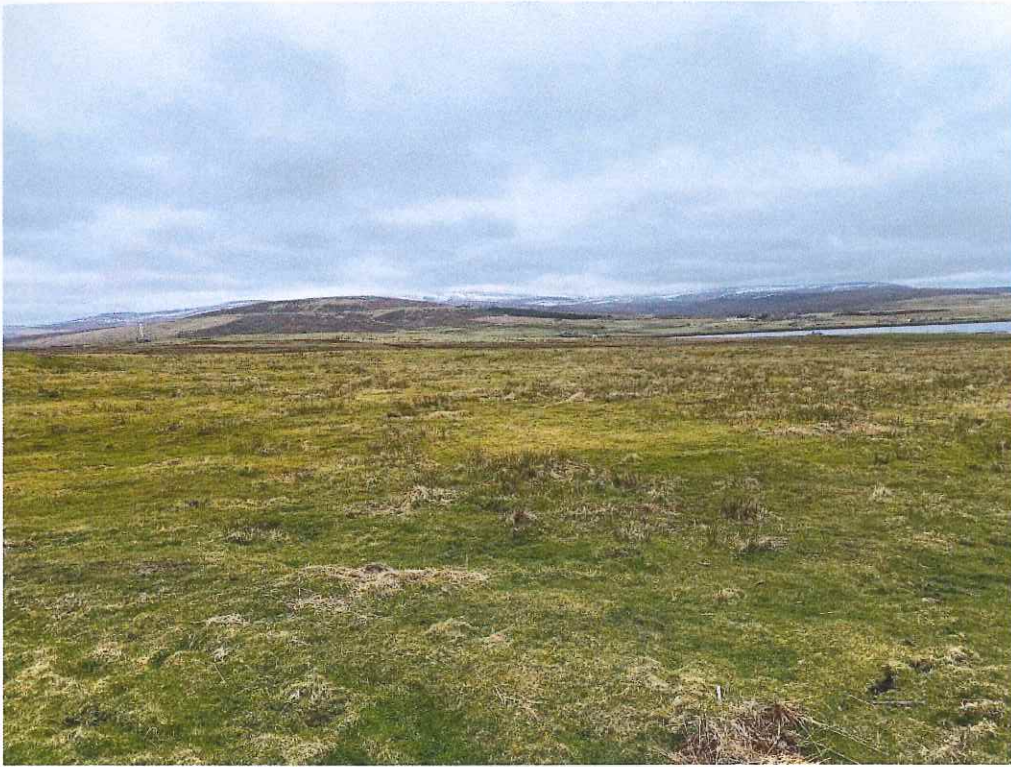
ND/31283/93443 Centre of proposed area (looking south)