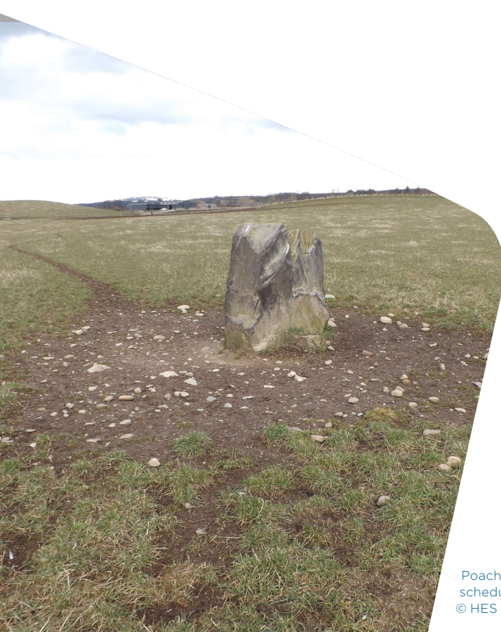
Poaching around a scheduled standing stone