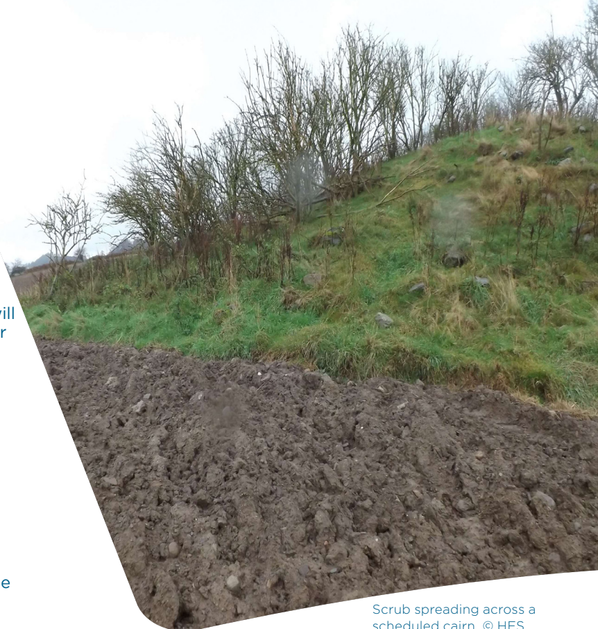
Scrub spreading across a scheduled cairn

Further advice on any options which involves ground-breaking works should be sought from Historic Environment Scotland.