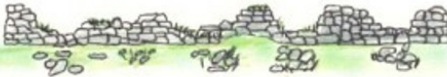
Not stock proof / in early stages dereliction