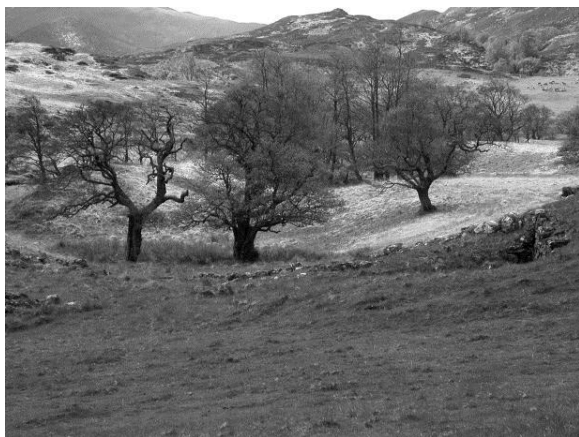
Pollarded veteran alders in wood pasture, Glen Strathfarrar