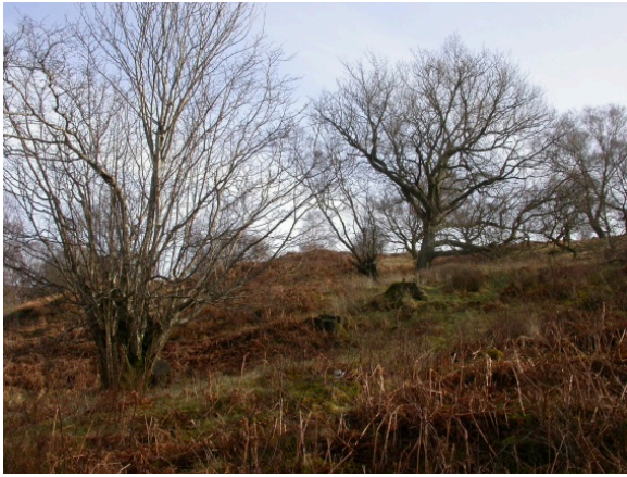
Open grown veteran oaks in upland wood pasture