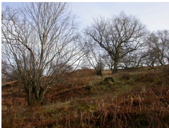
Open grown veteran oaks in upland wood pasture