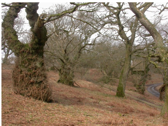
Lowland oak wood pasture at Loch Wood, Dumfriesshire

These have retained their value as cattle parks or as amenity ground for larger estates.