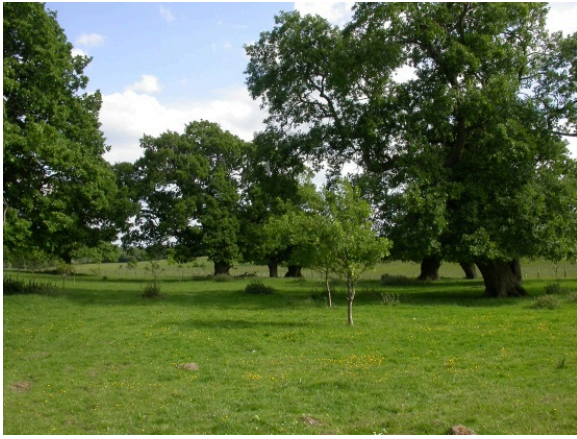
Lowland oak wood pasture at Dalkieth