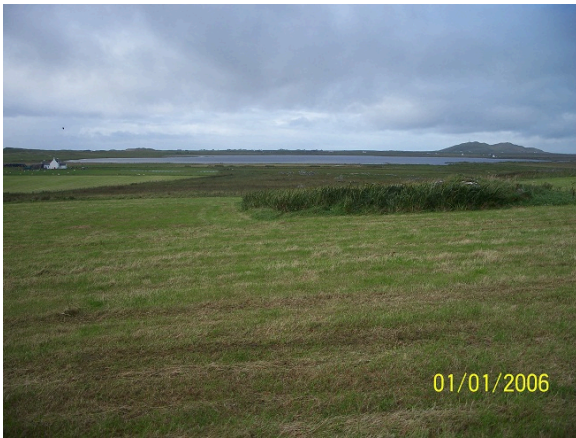
Corncrake habitat