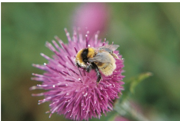
Great yellow bumble bee