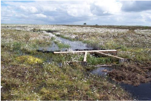
A-frame dam with diagonal timbers linked to the ditch bank