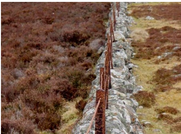
On the right side of the dyke the heather has been suppressed by grazing, and has been replaced by grassy patches

Under extreme grazing plants exist as single stem drumsticks, very tight, small topiary bushes, or the stems remain at ground level where annual shoots appear in summer before they are grazed-off every winter.