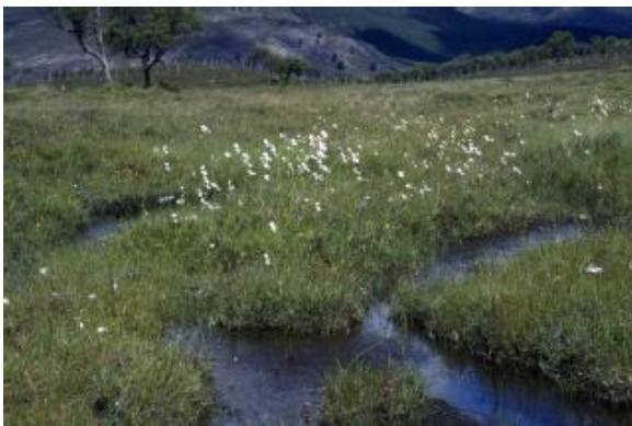
Bog vegetation

The vegetation tends to be dominated by a mixture of sphagnum mosses, sedges such as cotton grass, dwarf shrubs and, in certain areas, purple moor-grass and deer grass. Sphagnum moss is more common and forms continual carpets of moss.