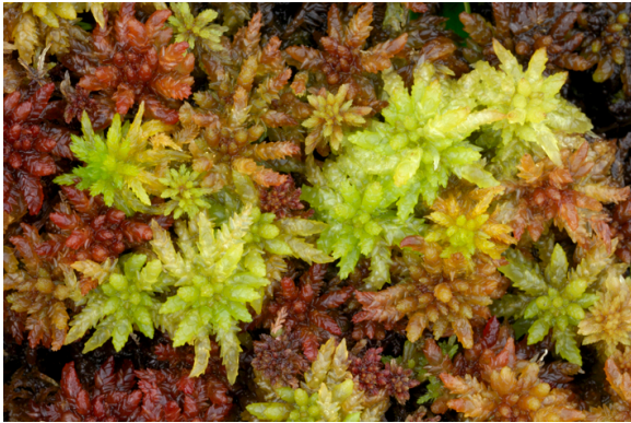
Sphagnum mosses