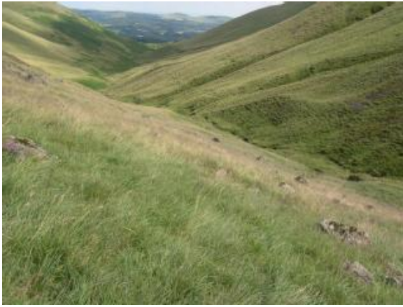
Calcareous grassland at Dollar Glen