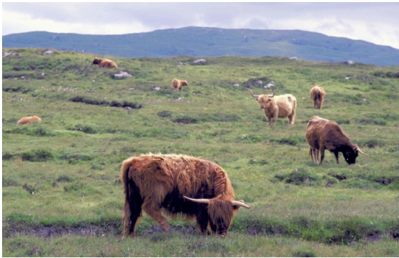
Highland Cattle grazing moorland. Summer grazing is part of traditional crofting systems

Cattle movement can break up bracken stands in summer, allow light to reach the ground and help to maintain grasses and other flowering plants in bracken stands where they would otherwise be choked out.