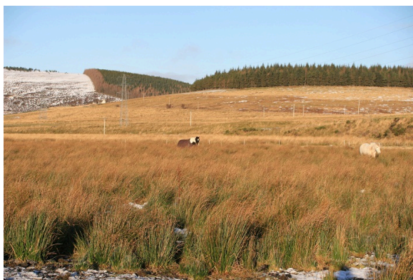
Field suitable for rush management – Credit: Hywel Maggs

This item can only be taken as a stand-alone capital item if the field is managed to benefit Greenland white-fronted geese.