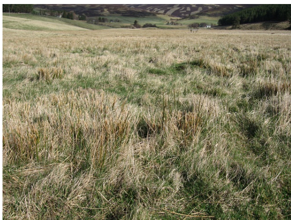
Field after good rush management