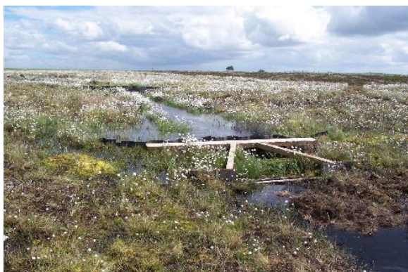
A-frame dam with diagonal timbers linked to the ditch bank

In most cases it is sufficient just to use two 4x4 posts bolted together, supported by two 4"x 4" stobs at either end. By bolting the two pieces of timber together with grain in opposing directions the combined structure will be much stronger than a single piece of wood of similar dimensions. The last two dams at the end of the run should have the diagonal supports which are held in place by stobs. The maximum length of 4"x 4" timber is usually is 3.6 metres. If wider dams are proposed, stagger the length to ensure the timber joints are not opposite each other and so weakening the structure.