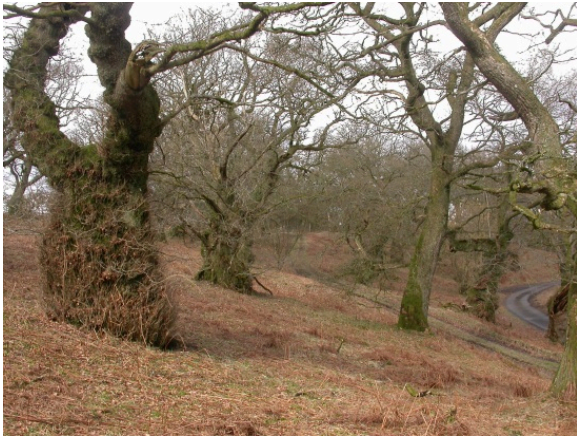
Lowland oak wood pasture at Loch Wood, Dumfriesshire