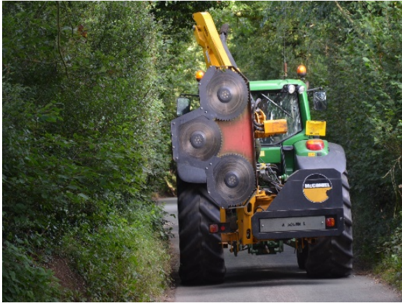
Shapesaw used for taking back heavy growth

You should match the type and weight of cutter or trimmer to the size and thickness of the branches to be cut. Light to medium flails should be suitable for one to two years growth. Heavy flails or, ideally, a 'shapesaw' should be used on heavier growth.