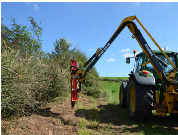
Shapesaw used for taking back heavy growth