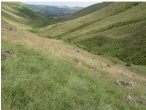
Calcareous grassland at Dollar Glen

Good management should aim to encourage stock to consume more of these grasses while preserving more sensitive habitats.